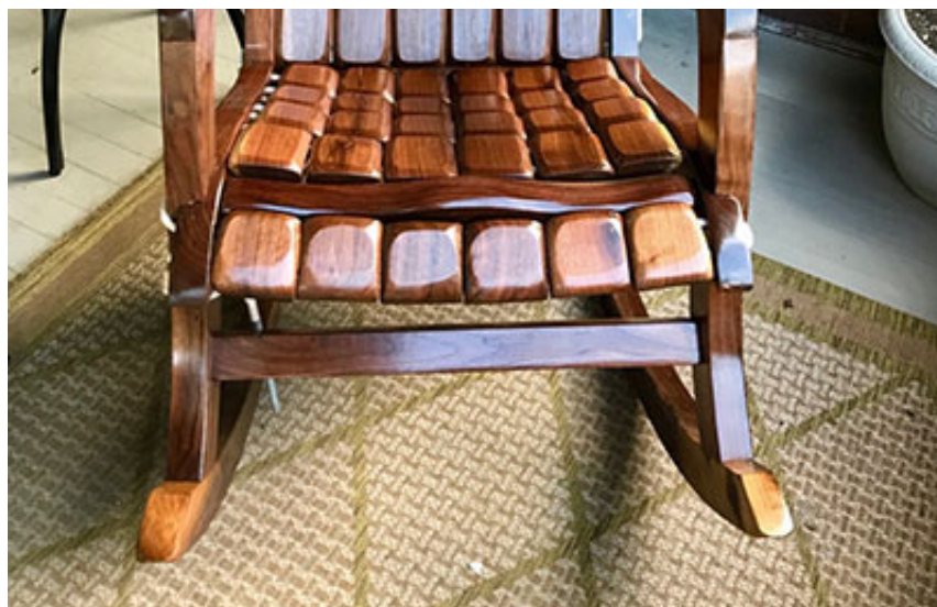
My family's newest heirloom...

That impressive-looking chair — currently sitting on my townhome's front porch because it's too large to fit in any standard door — is now the most expensive piece of furniture I own.